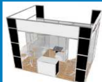
This picture is subject to modifications

850 companies 1500 participants 11000 BtoB meetings 40 countries represented