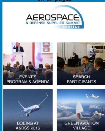
This picture is subject to modifications

Your company logo will be visible on all pages