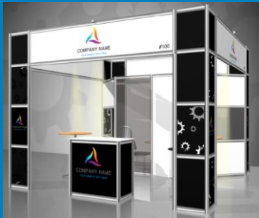
This picture is subject to modifications

850 companies 1500 participants 11000 BtoB meetings 40 countries represented