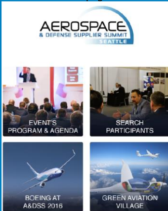
This picture is subject to modifications

Your company logo will be visible on all pages