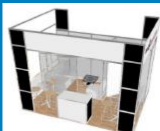
This picture is subject to modifications